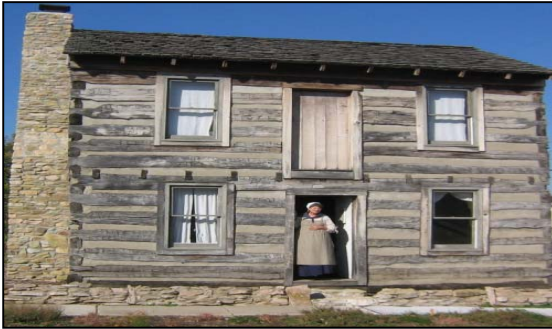
Corner of First and Middle Streets, Fairborn Map Location #1

The Mercer-Smith house, the oldest house in Fairborn, was built on its original site, circa 1799. The volunteers at the historical park continue to work hard to restore it to the year 1812. Monthly programs are scheduled throughout the year. Join us to see how folks celebrated Christmas in early Fairfield!