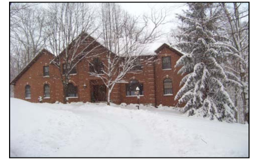
2490 Stewart Road, Xenia Map Location #3