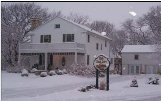
219 West Xenia Drive, Fairborn Map Location #5

Nestled deep in the woods, the Dixon Homestead is one of nine homes built around the original Mead Hunting Lodge. Built in 1989, this home's open floor plan and great room provide the ideal location to enjoy the fireplace while watching the deer! Five exquisitely decorated Christmas trees will be on display throughout this lovely home.