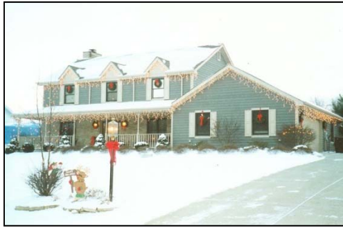
1614 Applewood Drive, Beavercreek Map Location #2

The Mercer-Smith house, the oldest house in Fairborn, was built on its original site, circa 1799. The volunteers at the historical park continue to work hard to restore it to the year 1812. Monthly programs are scheduled throughout the year. Join us to see how folks celebrated Christmas in early Fairfield!